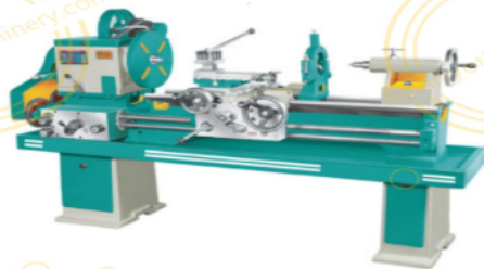
MEDIUM DUTY PRECISION LATHE MACHINE UPTO 80MM