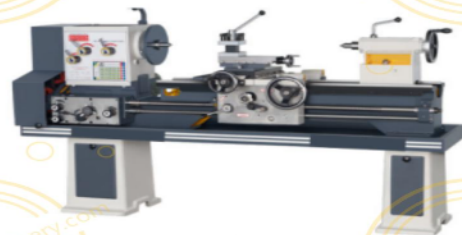
MEDIUM DUTY ALL GEAR LATHE MACHINE UPTO 80MM