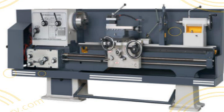
HEAVY DUTY ALL GEAR LATHE MACHINE UPTO 205MM