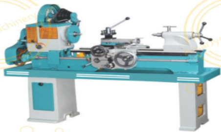
LITE DUTY PRECISION LATHE MACHINE UPTO 40MM